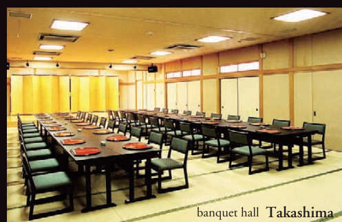
banquet hall Takashima