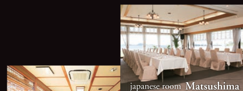
japanese room Matsushima

Please enjoy the meals that used a lot of foodstuff of seasons. These meals in Japanese style and half in Western style bring to you a memorable time of journey. The chef and staffs are always "Omotenashi" to you.