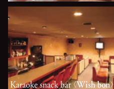
Karaoke snack bar (Wish bon)