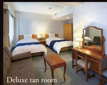
Deluxe tan room

This guest room of relaxed atmosphere recover from the fatigue of your journey. You can choose a Western style room or Japanese style room. We offer a room that has a great view of the Seto Inland Sea.